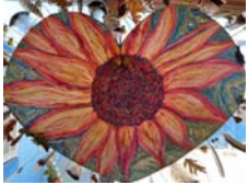
Bonita Gill, 2022 Metallic acrylic on foam core with local ephemeral bits