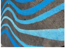
Painted by the Blue Mountain Lead Up Teen Program, 2022