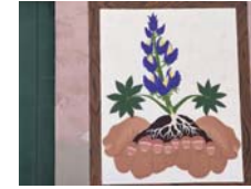
Delilah Garcia, 2022 Acrylic paint "May we aspire to be as resilient as Lupine's beautiful blooms"